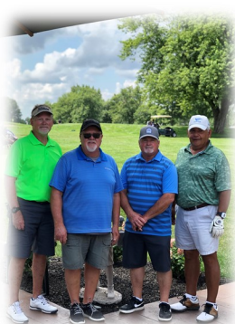
2021 Golf Outing Champions

The Jim Rutherford Scholarship was established by the McLean County Soil and Water Conservation District to assist outstanding agricultural students at any Illinois College. The student awarded the scholarship should demonstrate superior agricultural academic achievement, commitment to soil and water conservation and potential for innovation and/or leadership ability. The Jim Rutherford Scholarship is awarded in the fall semester of the academic year. This scholarship fund is made possible by generous donations from local donors. Each year an annual golf outing is held to raise the necessary funds. Help support the next generation of local agri-business professionals! Fourteen local scholars have been awarded since inception for a total of $7000 to attend 8 different Illinois colleges. To make a donation, please contact our office.